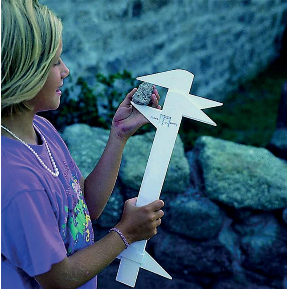
Fig. 1.4 for Question 1