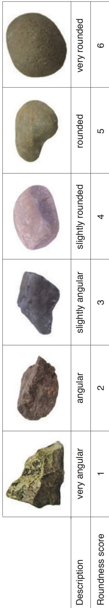
Power's Scale of Roundness